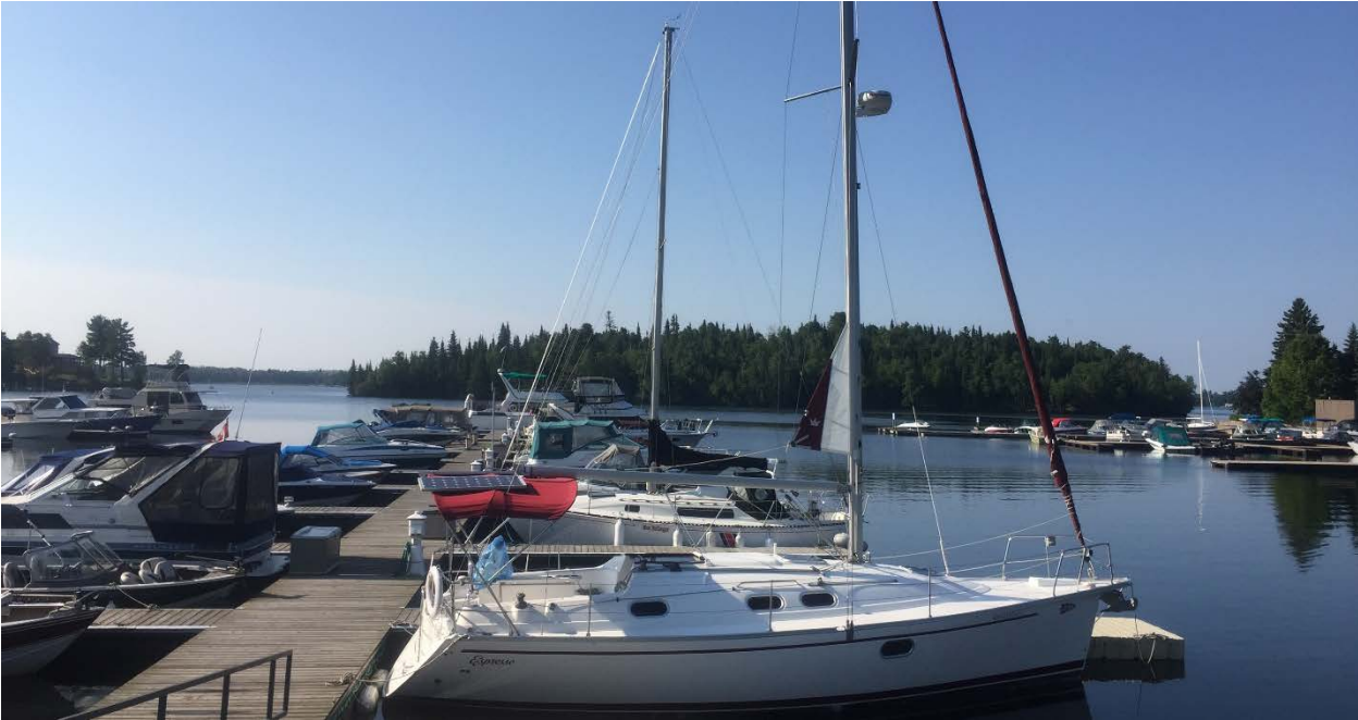
Photo 1 – Perspective south showing the northside of the island and channels on the east and west in view from Changes in Latitude docking facility on the mainland

Site visits were conducted on August 1 st , 2017, where I viewed the property from the mainland shore and by boat. Photos showing the island are below.