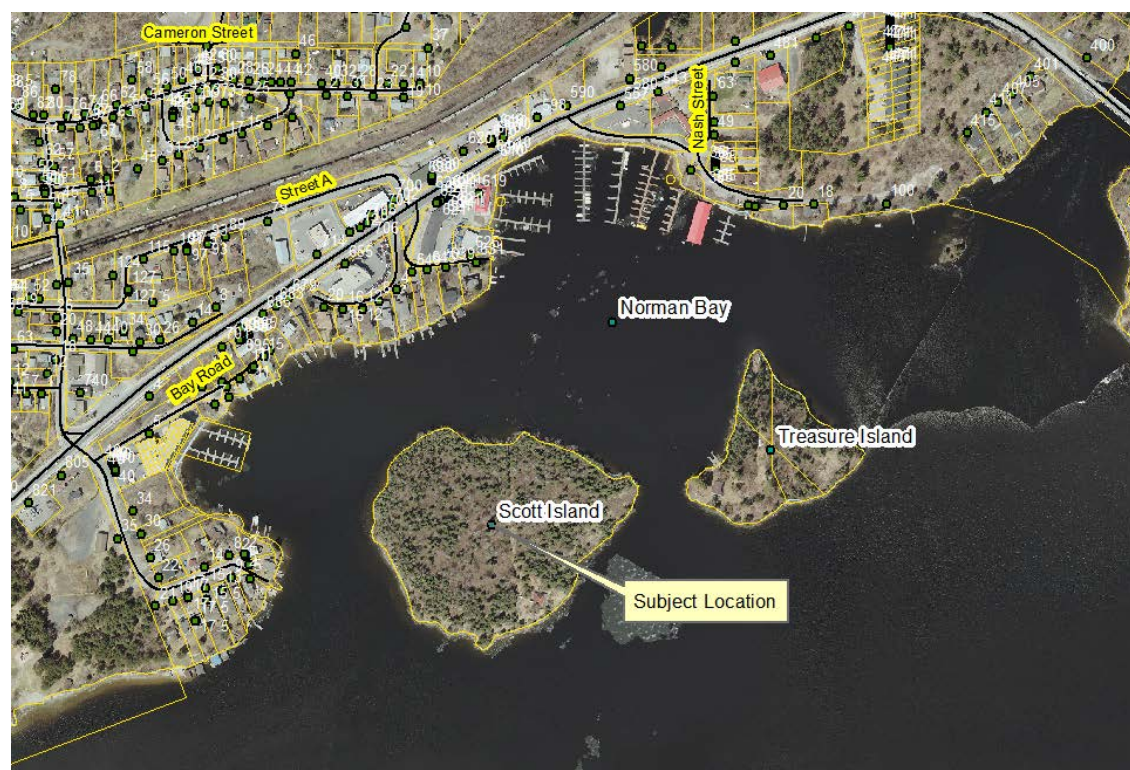
Figure 1 – Aerial sketch displaying property boundaries

The property is located at Scott Island, Island K144, Parcel 237, Norman Bay. See figure 1 below for a map.